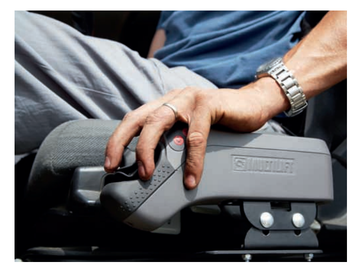
Automatic Sequence Control and Friction Relief Automatic Sequence Control and Friction Relief makes loading, unloading and tipping silent, easy and quick.