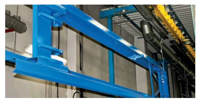
Securing quality and uptime The hooklift is top coat painted in customer colours at the factory which secures quality, controlles and lowers VOC emissions and reduces installation time.

emissions and reduce installation time. As a whole, Hiab offers an extensive range of factory-produced options to cater for individual customer needs. This results in reliable components, quick installation and better parts availability. Besides short lead time, within production Cargotec continuously strives for improved sustainability and high recyclability – with minimised use of scarce material.