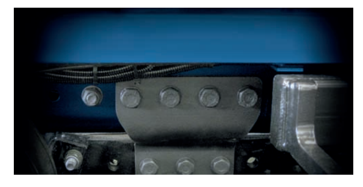
Fast installation The hooklift is quickly and reliably bolted on the frame.

Hiab Multilift XR models are top coat painted in customer colours at the factory to further secure quality, low VOC